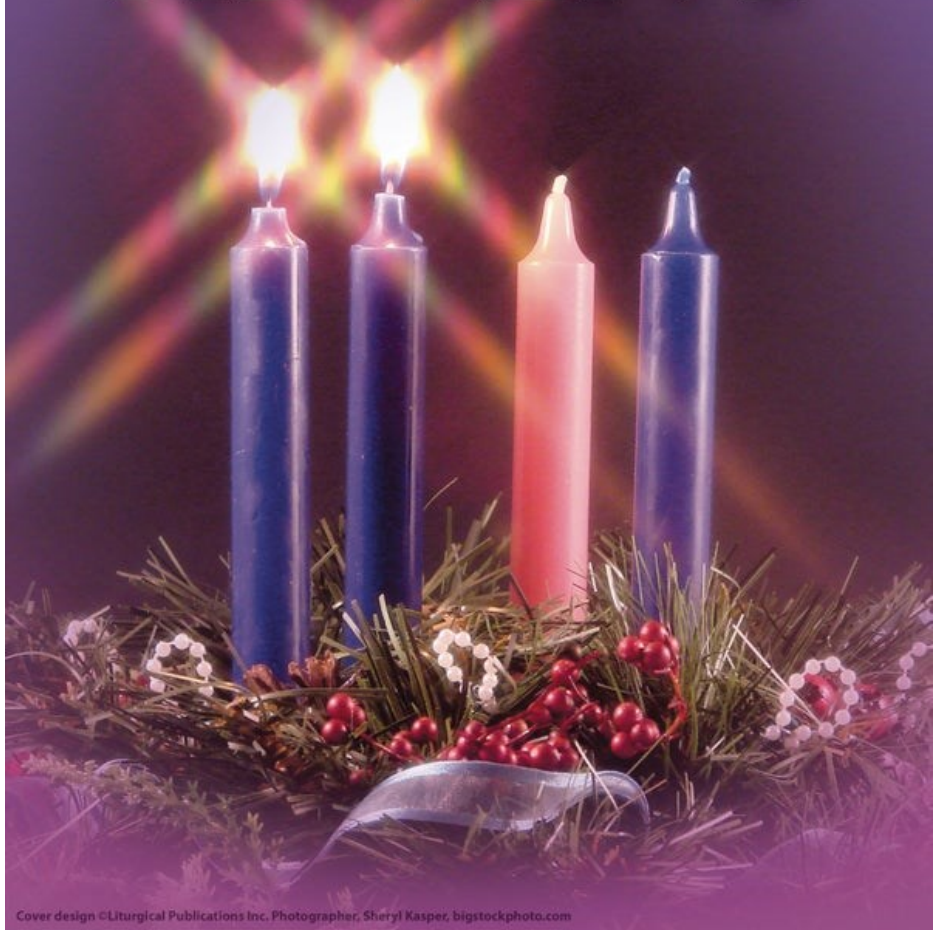
Cover design ©Liturgical Publications Inc.